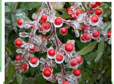
Winter 2005 Ice Storm On Nandina Shrub