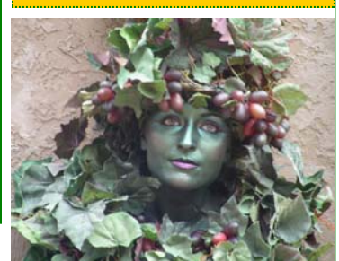
The Vine Lady See Page 2 for more