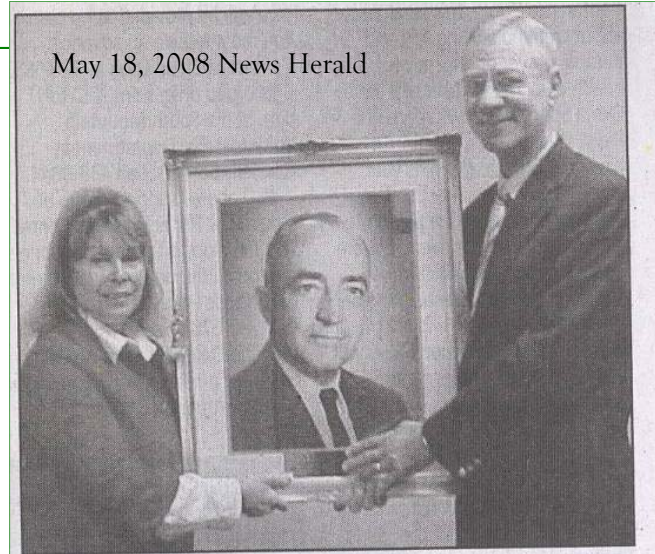
May 18, 2008 News Herald