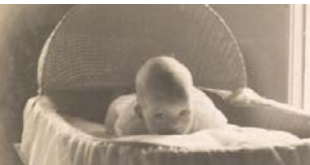
July 8, 1950 – March 8, 1951

These events brought me to think about the first time