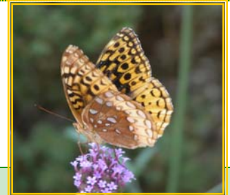
Butterfly In Garden