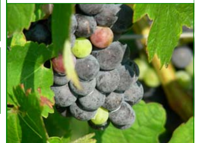
Grapes on the Vine