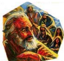
Paul and the other apostolic leaders kept God's seventh-day Sabbath their holy day.

Now that no one is justified by the Law before God is evident; for, "THE RIGHTEOUS MAN SHALL LIVE BY FAITH."