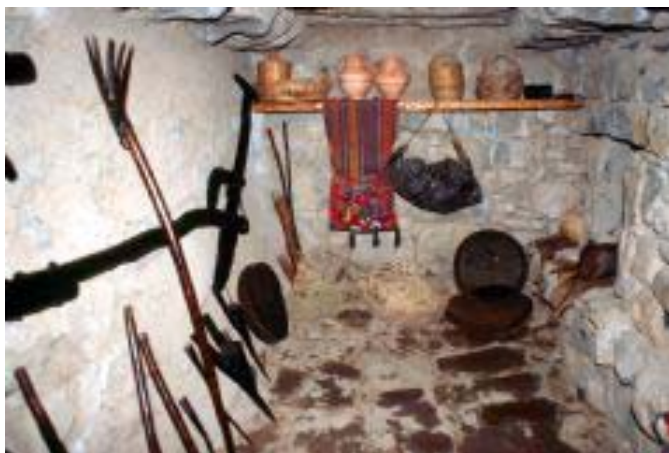
Tools used in Jesus' Day

“ONLY WHAT’S DONE FOR CHRIST WILL LAST.”